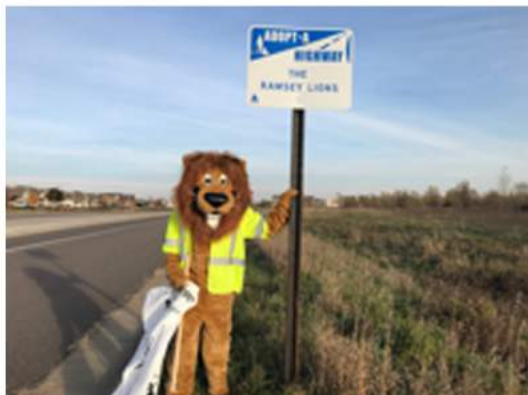
In October the Ramsey Lions picked up trash on Bunker Lake Blvd between Ramsey Blvd. and Armstrong Blvd.