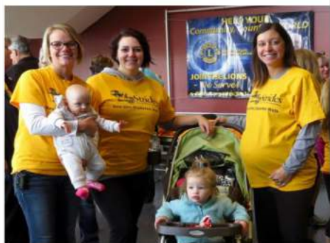
The New Ulm Diabetes Walk is a Family Affair for all ages.

The Lions Club of New Ulm from District 5M3 and the Lafayette Area Lions Club from District 5M2 again joined forces on September 30, 2017 to hold their Third Annual "New Ulm Diabetes Walk". Over $12,600.00 was raised for the Minnesota Lions Diabetes Foundation and over forty walkers participated. These funds will be used to find a CURE for diabetes at the University of Minnesota. Thank you to all the Lafayette Lions, New Ulm Lions and others who helped, participated and donated to this very successful event.