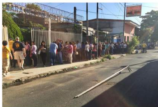
A typical mission Lion eyeglass mission serves about 4000 over 5 working days. Next years missions will be to Nicaragua and El Salvador in February of 2019.