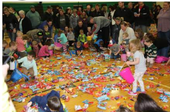
The Maple Lake Lions hosted a Palm Sunday Candy Scramble for local children.