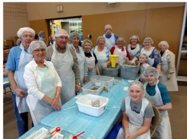
The Montrose Lions Club along with a few friends helped pack food for Truckload for Life at Zion Lutheran Church in Buffalo. The group bagged 80,000 meals that day.