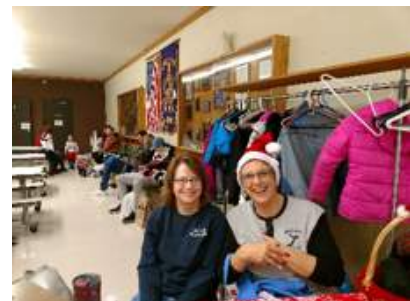
Lioness Kathy and Sandy