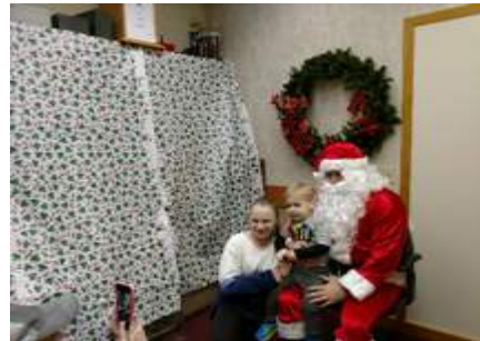
Santa with two first visitors