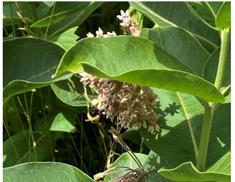
The milkweed also offers

nectar for the bees – important pollinators.