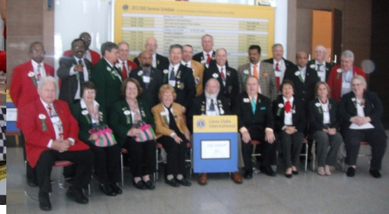
Congratulations! DGE participants in DG School

This is a time of new beginnings. I have high hopes that we can all work together in meeting the challenges as well as in embracing the opportunities for the growth of Lionism in District 4L6. Let us translate into action the theme that will underline our programs and activities: "Service With Love." Let us stand together united in thought and action as we serve.