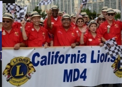
International Parade of Lions Busan Korea