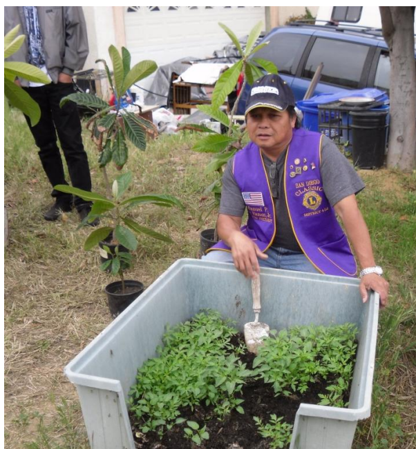
These seedlings are not ready for planting yet