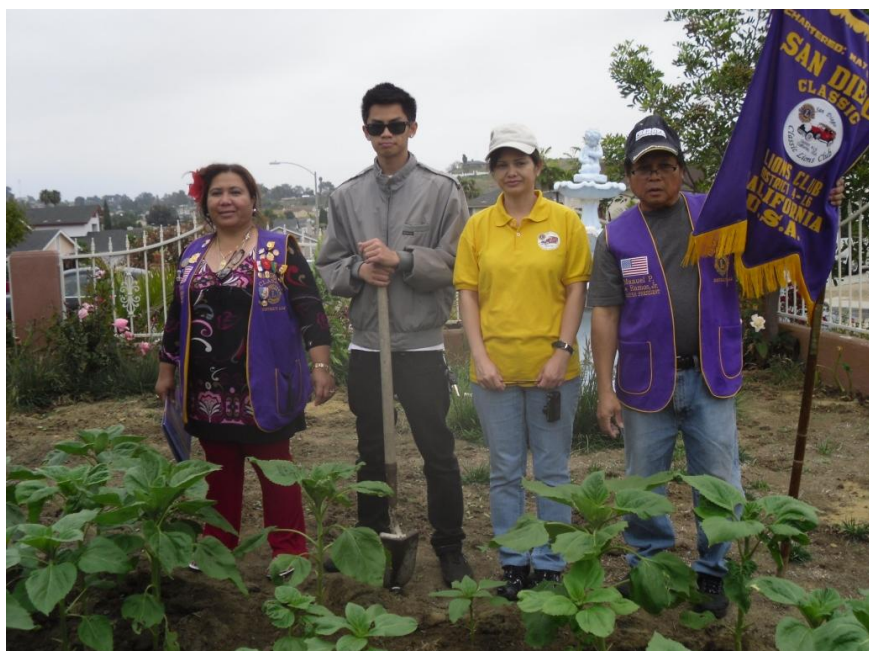
These mature seedlings went in the ground