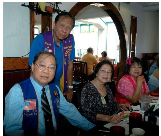
...at the SD Executive Installation