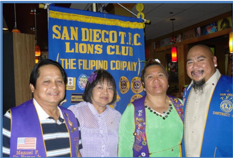
... At the SD T.F.C. Installation