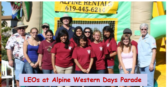
LEOs at Alpine Western Days Parade