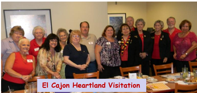
El Cajon Heartland Visitation