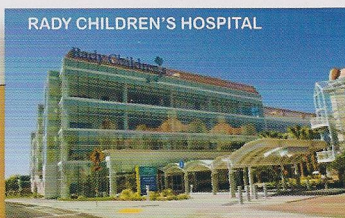
RADY CHILDREN'S HOSPITAL

$450/Table of 10 - $50 Each before 8/31/11