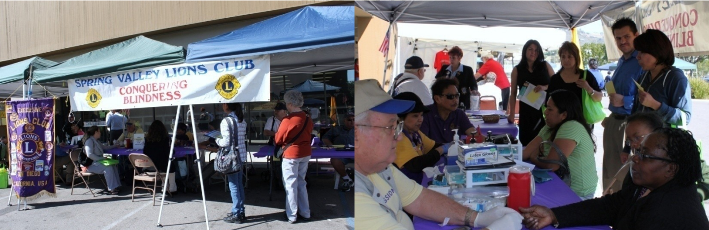
2-25-2012 Lemon Grove Health Fair, Lemon Grove CA - A collaboration of 3 Lions Clubs: Spring Valley Lions, Poway Lions and San Diego Executive Lions attending blood pressure and blood glucose test to the community

This report reflects an alarming state of health for such a small demographic community. The cases mentioned above demonstrate an absolute need for more health awareness (education), follow-up, and screening programs for this area.