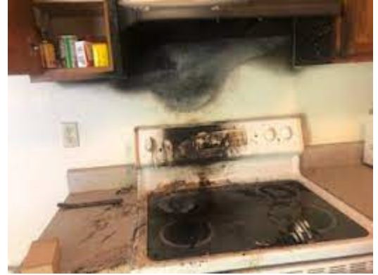
Not actual Upland Lions photo.

Now, the Upland Lions Club is in need of your help. In the wee hours of Sunday morning, October 17 th , we had a fire in the kitchen. We had worked the Fall Festival on Saturday, the 16 th . In taking our supplies back to the clubhouse, we had inadvertently set a box on one of the kitchen stoves, hitting the knob ever so slightly. Sometime in the middle of the night, the box had finally gotten hot enough to combust. Thankfully, we have an exhaust fan and a large hood above the cooking area. The fire was contained inside that hood and prevented any structural damage to the building. We only lost that stove, but the building is all tarnished with soot. Enormous clean-up job, according to the fire restoration company.