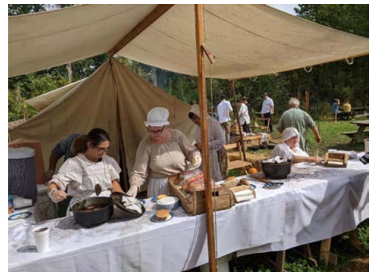
Kokomo Lions also participated in the three day festival in October.