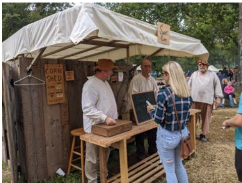
Marion Lions sold sweet corn during the festival.

Mississinewa 1812 is the historical commemoration of the Battle of Mississinewa fought in Grant County on December 17-18, 1812.