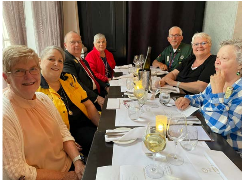
Indiana Delegation enjoying each others company while in Montreal