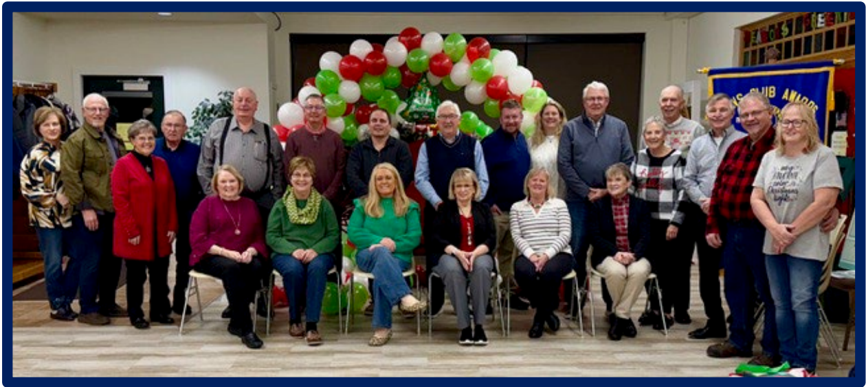
Photo: Lions Members and guests in attendance.