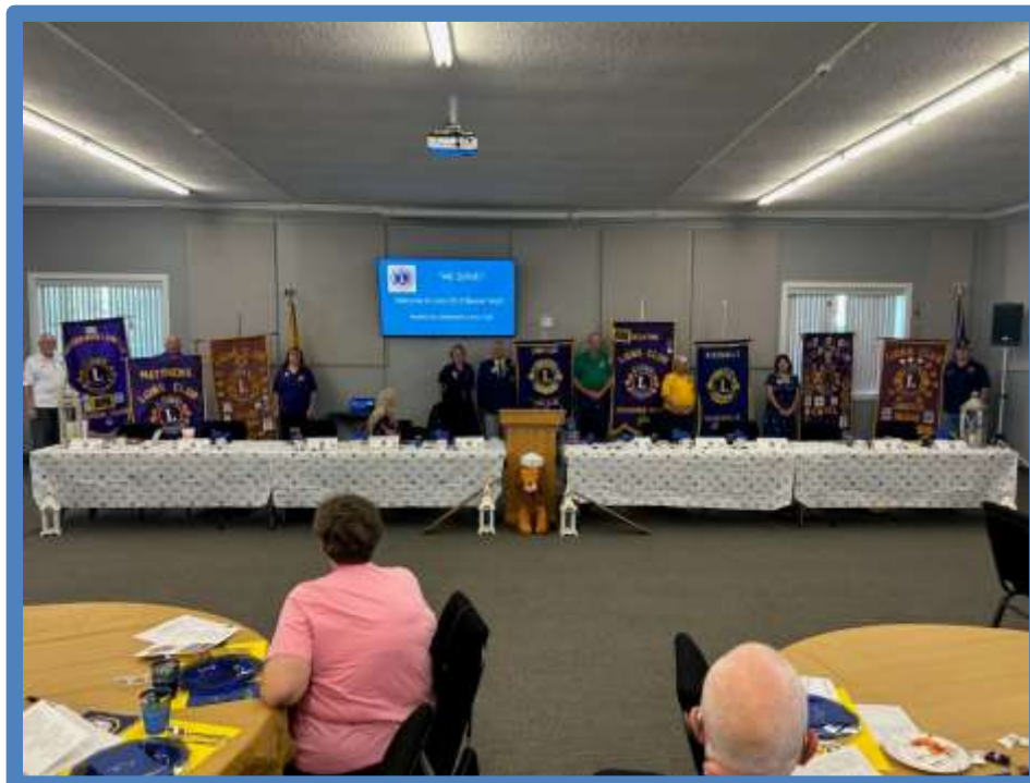
Photo: Banners of some of the clubs present at Banner night