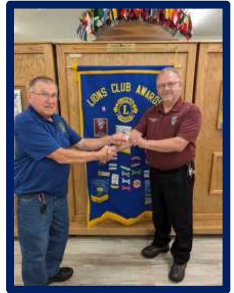
Membership Key