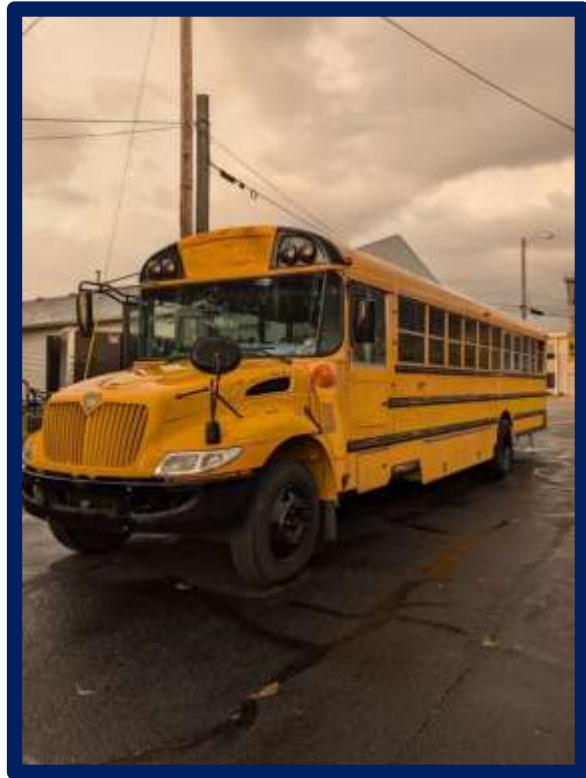
Photo: The bus outside