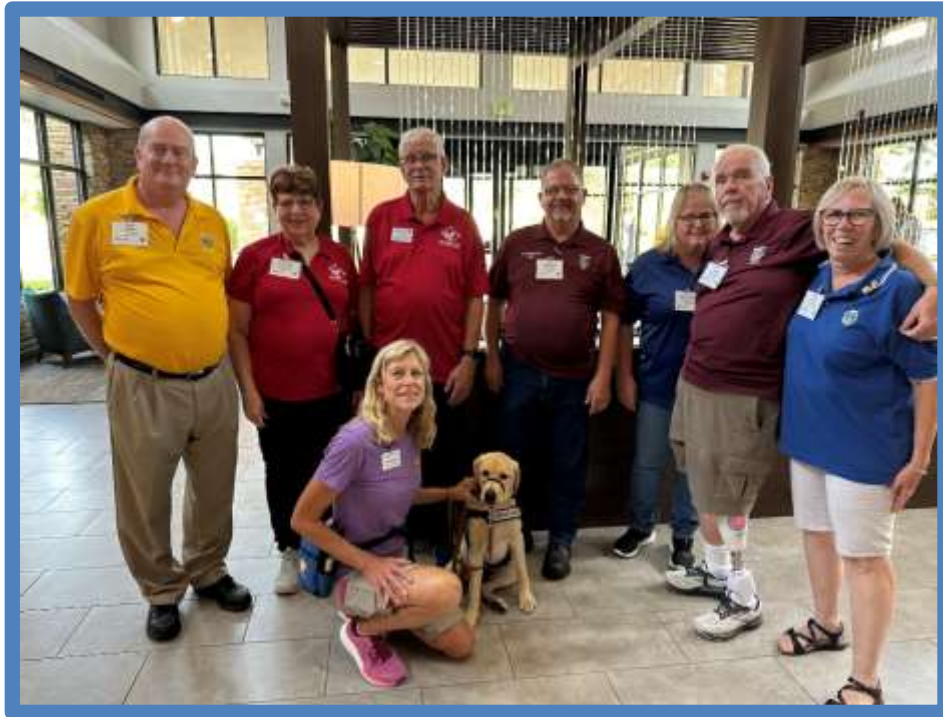
Photo: The group from Indiana that attended.