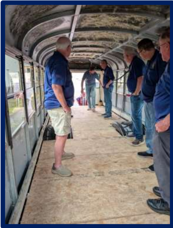
Photo: The bus inside