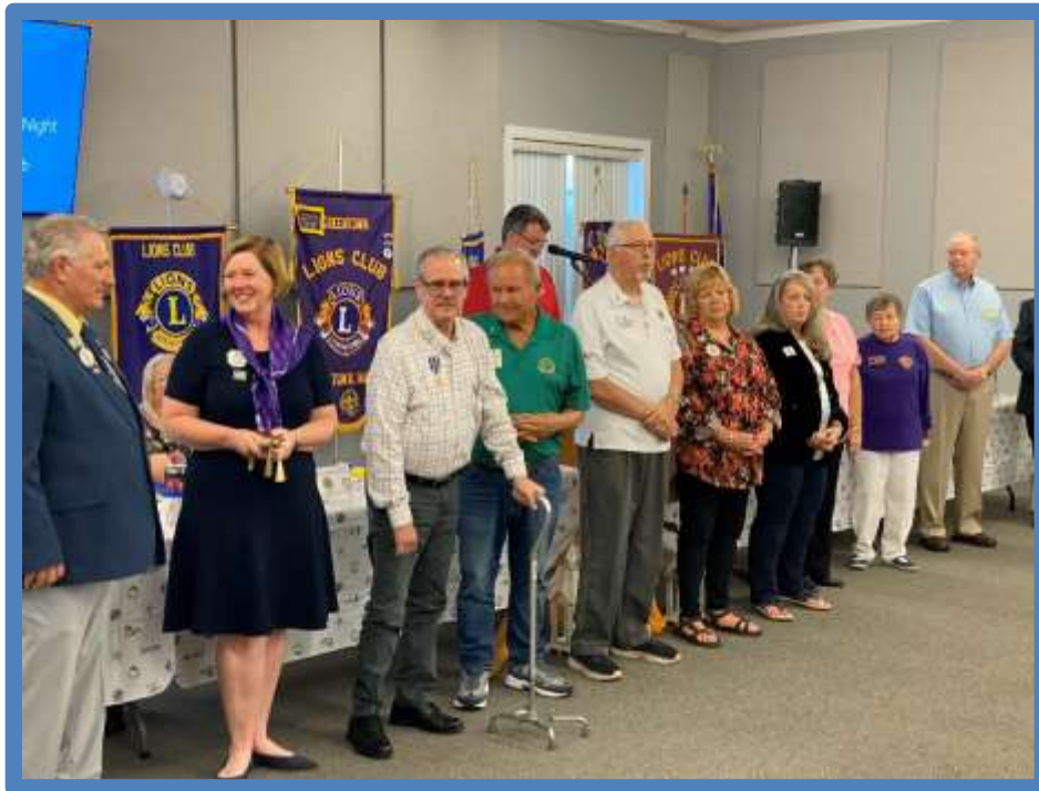
Photo: Past District Governors get together to pass the scroll.