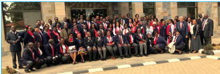
Region 4 - 6 at Andrews Motel, Lusaka with 99 Members in attendance

A District workshop for All Incoming Club officers was held on the 14th July, 2018 at Mubende Lodge, Luanshya and Andrews Motel, Lusaka..