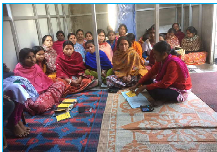
The women in the program gather once per week to discuss business and make their loan payments.

The two-year pilot project involved Eastern India Lions Leadership Academy and a micro-lending bank, ASA International India Microfinance, Ltd.