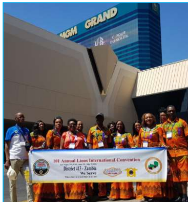
District 413 - Members

From June 29th - July 3rd, Lions from District 413 - Zambia joined the rest of the world for the Lions International Convention in Las Vegas, NV, USA. The Convention Highlights features excitement and culture from the Lions camaraderie at exhibit hall and plenary sessions, and the beautiful scenery of Las Vegas.