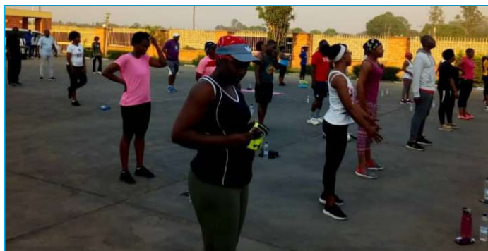
Early morning Aerobics Mania Fitness Activation Participants

Lions Club of Luangwa in partnership with Defined Style Fitness held an Aerobics Mania Fitness Activation on the 22nd September, 2018 at NASDEC in Lusaka, Zambia.