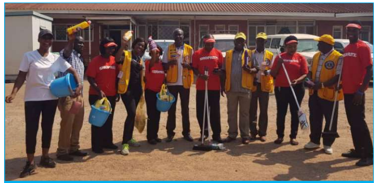
Lions Clubs of Chililabombwe