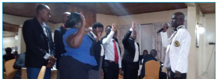
New Lions being inducted during the Chipata Board Installation at Luangwa House, 15th September, 2018