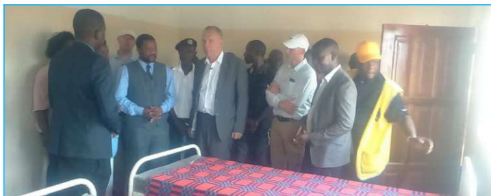
Tour of the Facility