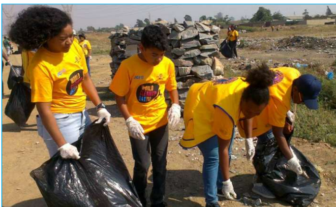
Lusaka Lions cleaning Tokyo way Lusaka