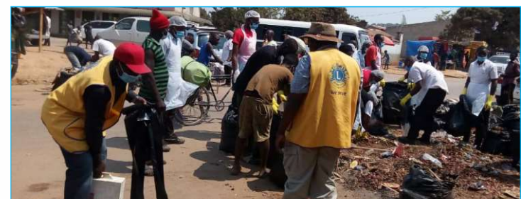
Kasama Lions cleaning Chambeshi Market