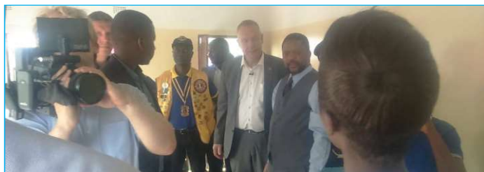
The Governor and other dignitaries listen to brief by health official during the tour of the facility

The Shelter was built at a cost of K144, 000 by Lions Aid Norway in partnership with Lions club of Chongwe.