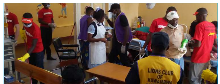
Zone 7 Lions Cleaning at Kabwe General Hospital