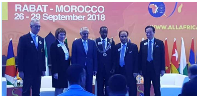
International President's Office Group Photo

From the 24th All Africa Conference which was held in Rabat, Morocco 26th - 29th September, 2018 with a participation of 328 Lions from different countries, Algeria, Angola, Benin, Botswana, Burkina Faso, Cameroon, Canada, Chad, Congo, Democratic Republic of the Congo, Egypt, England, France, French Guiana, Gabon, Germany, Ghana, Guinea, Hong Kong, Iceland, India, Italy, Ivory Coast, Japan, Kenya, Korea, Lebanon, Mali, Mauritania, Morocco, Nigeria, Nepal, Netherlands, Senegal, South Africa, Tanzania, Togo, Tunisia, Uganda, United States, Zambia, and Zimbabwe