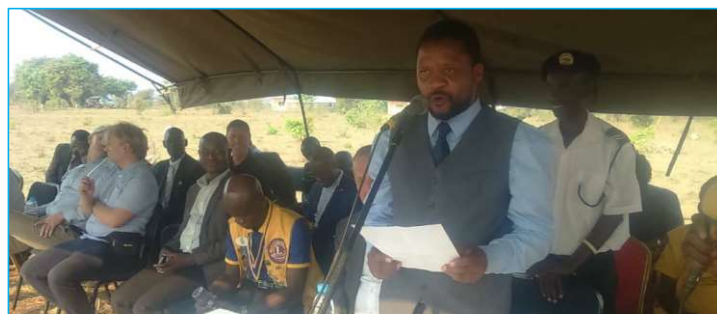
Speech by the Guest of Honour, his worship the Deputy Mayor for Chongwe Municipality