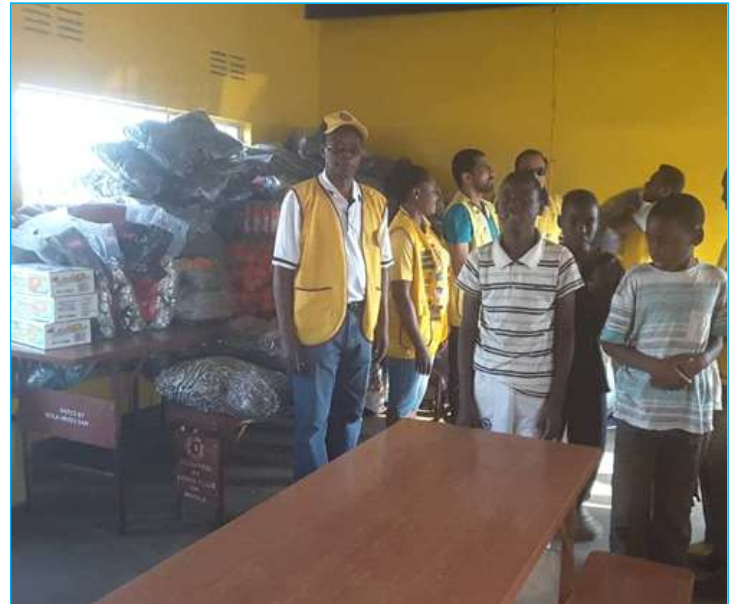
Members of Lions Club of Ndola getting ready to distribute pillows and pillow cases to pupils at NLSVI

The cost of the meal, which was nshima and chicken, orange fruits, drinks, biscuits and munchos was K1,200.