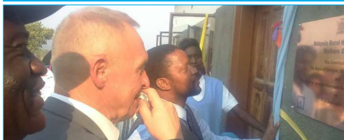
Unveiling of the plaque by the Guest of Honour & his worship the mayor of Jevnaker Kommune, Norway