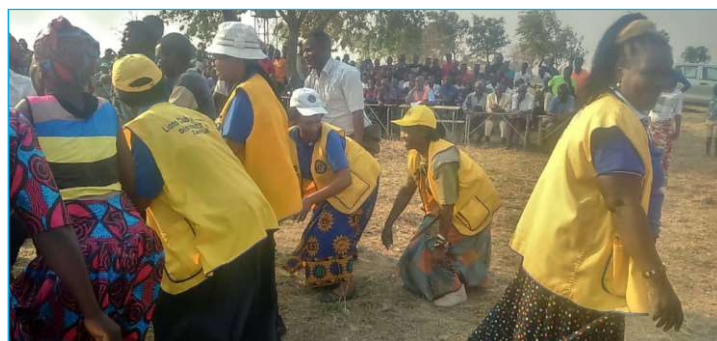
Lions join the Community in a celebration dance