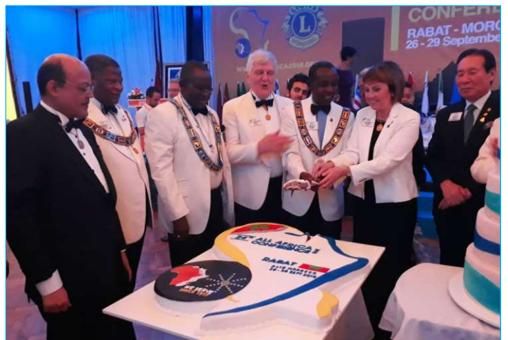
Cake cutting Ceremony ID and Inter. President