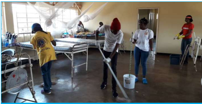
Solwezi Leos, Lions of Mutanda and Kansanshi at Solwezi General Hospital