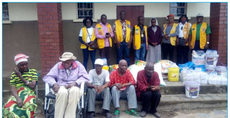
Lions Club of Makeni donated food stuff and cleaning materials to Cheshire home in Chawama on the 29th December, 2018