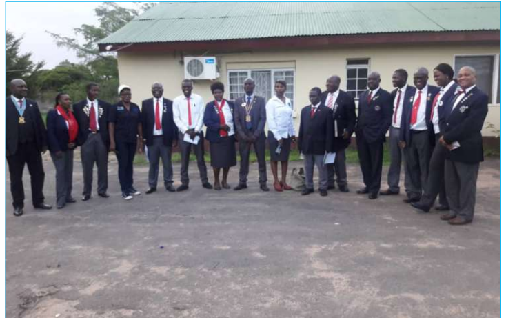
Group photo taken during the Zone 10 Meeting on the 29th December, 2018 at Mongu Lodge