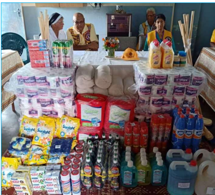
Photo taken during the handing over to Ndola Ecumenical Hospice Association