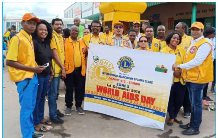
Members from Lions Club of Ndola pose for a photo during the March past

Later in the same day the Club donated cleaning materials and toiletries to Ndola Ecumenical Hospice Association - St Theresa's Village in Masala. The total cost of the items was K6,740.