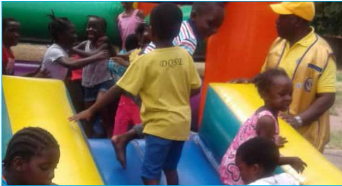
Photo taken during the Fundraising activity at Mongu Lodge on 1st December, 2018

On the 1st of December, 2018 Lions club of Mongu had a fundraising activity at Mongu Lodge, to raise funds towards the purchase of side bed chairs for a Male medical ward.