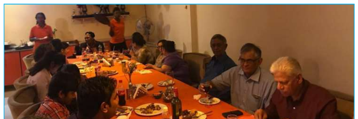
Photo taken during the fellowship at Nawab's restaurant