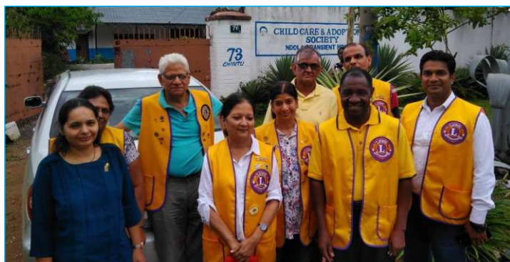
Members of Lions Club of Ndola pose for a photo during the donation of food hampers and pillows to Child Care and Adoption