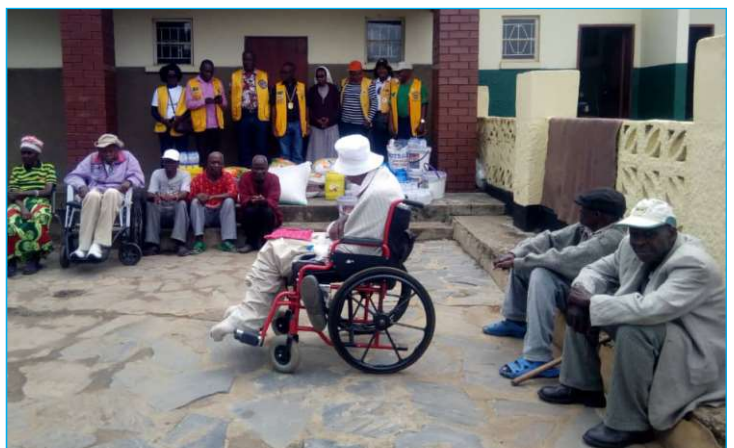
Photo taken during the Lions Club of Makeni donation at Cheshire home in Chawama on the 29th December, 2018