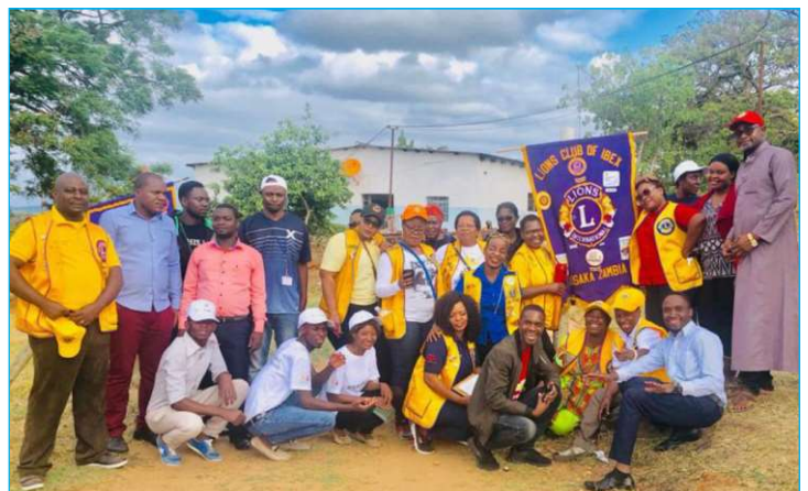
Photo taken during Zone 14 joint Medical Camp at Katoba Clinic with the Lions and Medical Team

Services offered were Diabetes, Eye Screening, Cervical Cancer Screening, HIV Testing and Counselling.