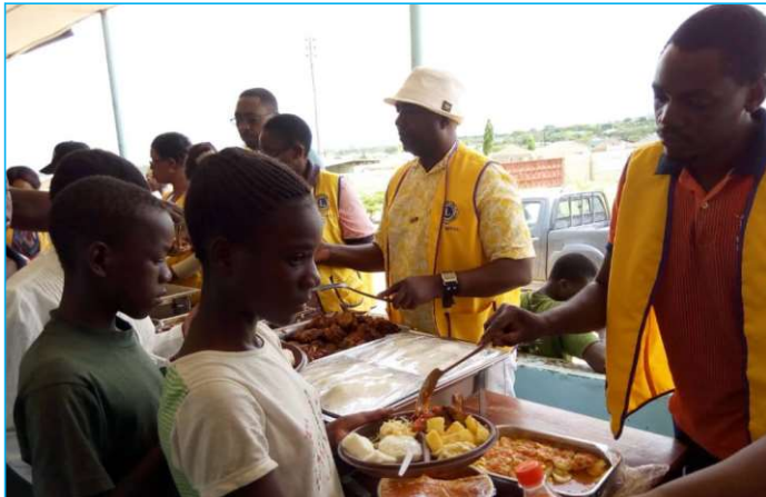
Lions Club of Choma Lions serving food to the residents of Nest orphanage centre