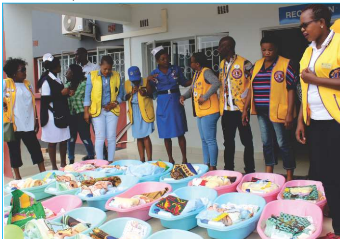
The Lions and hospital staff with the hampers before the donation at Chawama Level One Hospital

The hampers included a baby bathtub, a blanket, nappies, chitenge material (cotton cloth wrapper), lotion and powder.