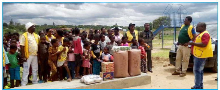
Lions Club of Choma Lions handing over the food stuff to Nest orphanage centre

The Lions Club of Choma undertook a project at Nest orphanage centre in Choma on 29th December, 2018. This event marked the Relieving the Hunger Global Service Action Campaign where Members participated in the food preparations, and donated items worth K3, 629.