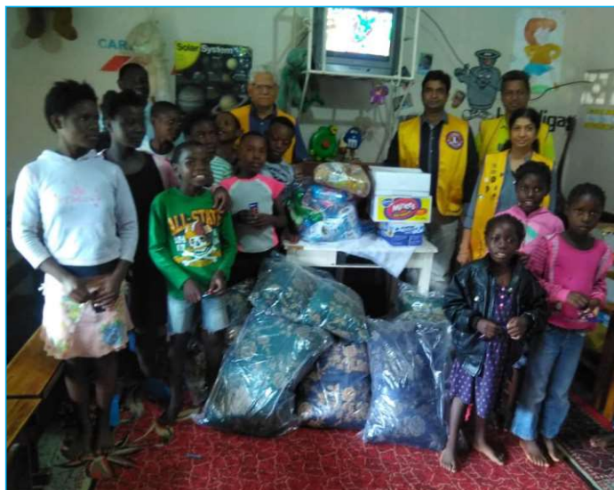
Members of Lions Club of Ndola pose for a photo with the residents of Child Care and Adoption

The Total cost of Donation was worth K1, 000.00.