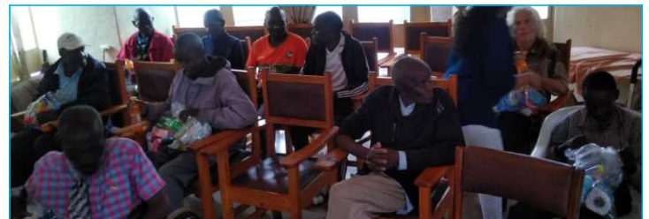
Photo taken during the Club donation of hampers to Mitanda home for the aged

Everyone seemed to have enjoyed the evening.