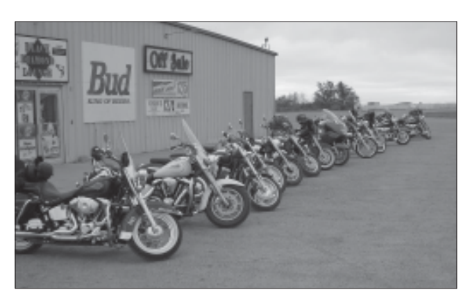
Waiting to go again after the second stop.

The Bismarck-Mandan Ridin' Lions Club's 3rd annual charity motorcycle run, called "Pride Ride III," was held in mid-September. Although the weather on Sept. 17 was cool (some said cold) and blustery, 27 riders participated in the event used to raise funds for Vision USA North Dakota and the local chapter of the American Cancer Society.