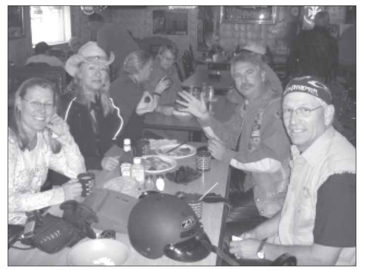
Lunch stop in Beulah