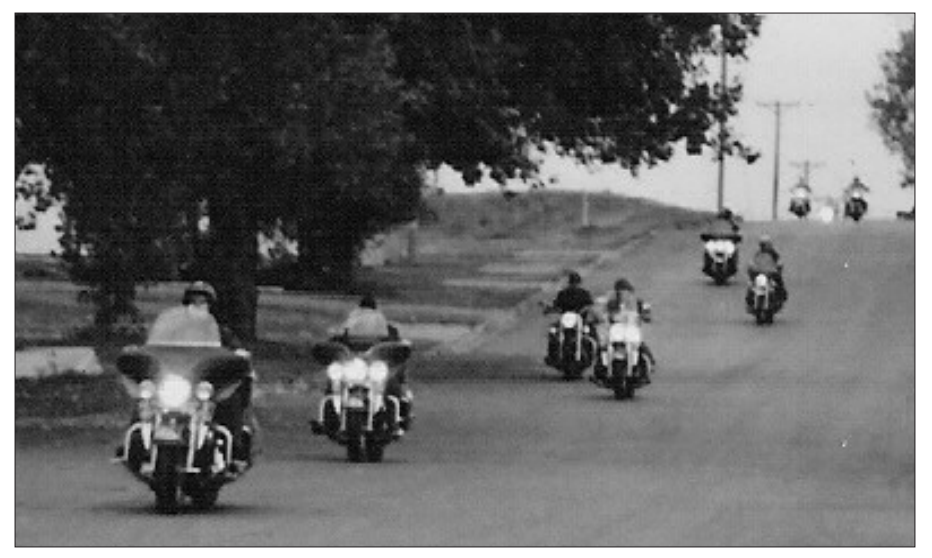
Arriving at the fourth site on Main Street, New Salem.