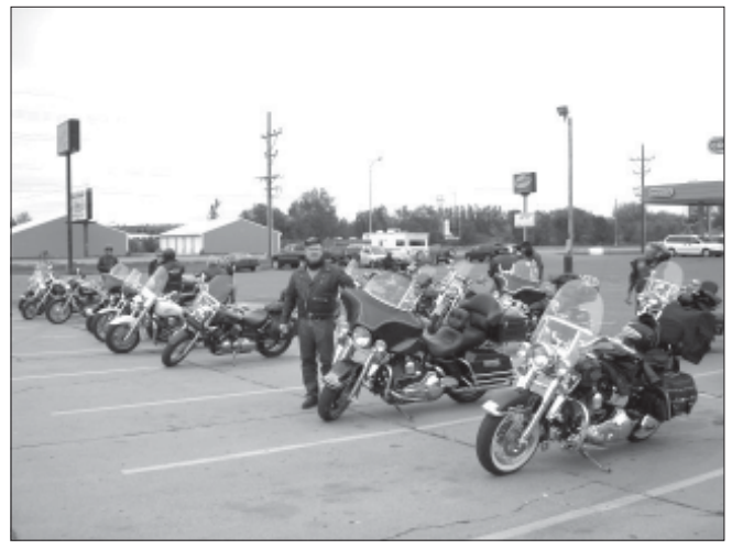
At the start, getting ready to go.