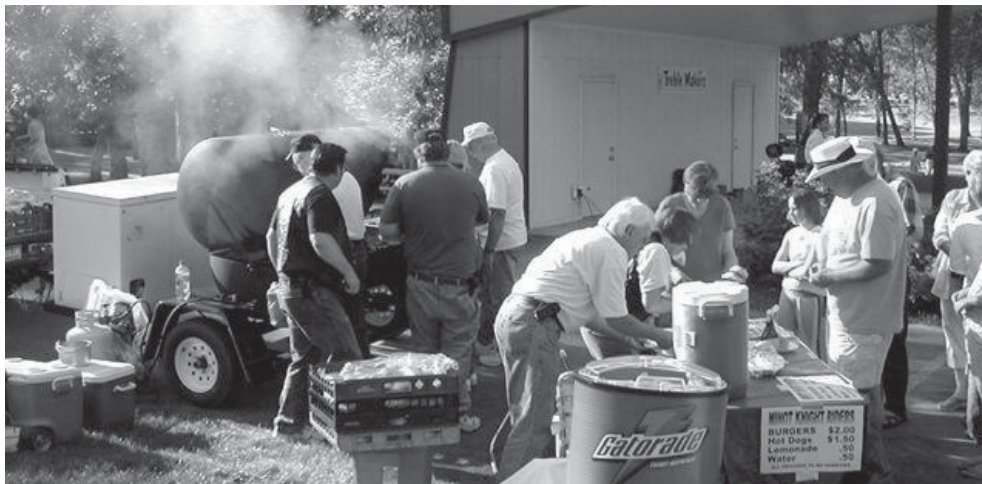
This event was "At the Hop" in Oak Park-Minot.