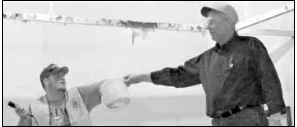
It was bingo time for the Goodrich Lions March 8th.

The raffle prizes were a toy John Deere tractor, a portable grill and a handmade wooden birdhouse in the shape of a chair, large enough for any bird, or human, to rest upon. Raffle ticket prices were affordable, $1 for a chance to win one of the prizes. Bingo admission tickets that were pre-sold were given an extra-special chance with a drawing just for them.