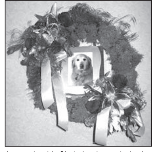
A wreath with Simba's picture is in the memorial display for Simba at Bethany.

Today, a Simba memorial center is inside Bethany's main entrance. It includes pictures of her, a wreath, even flowers sent by Red River Hospice. And there