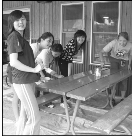
Camp attendees painting tables at the Youth Camp.

Thursday we got off early for our day in Dickinson. We began our day at the Dickinson Dinosaur and Geology museum and the Joachim interpretive center. There were restored old farm house, a depot, country store, a Lutheran Church as well