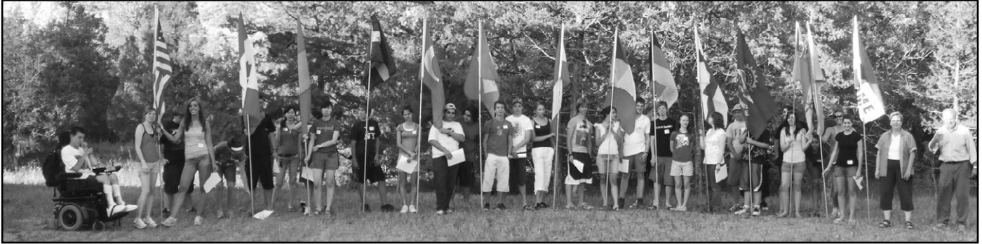
Young people from around the world joined their counterparts from MD5 for a photo at the Badlands Ministries Bible Camp near Medora.

Volume 31, Number 2 Official Publication of Lions Districts 5NE, 5NC, 5NW, August 2008