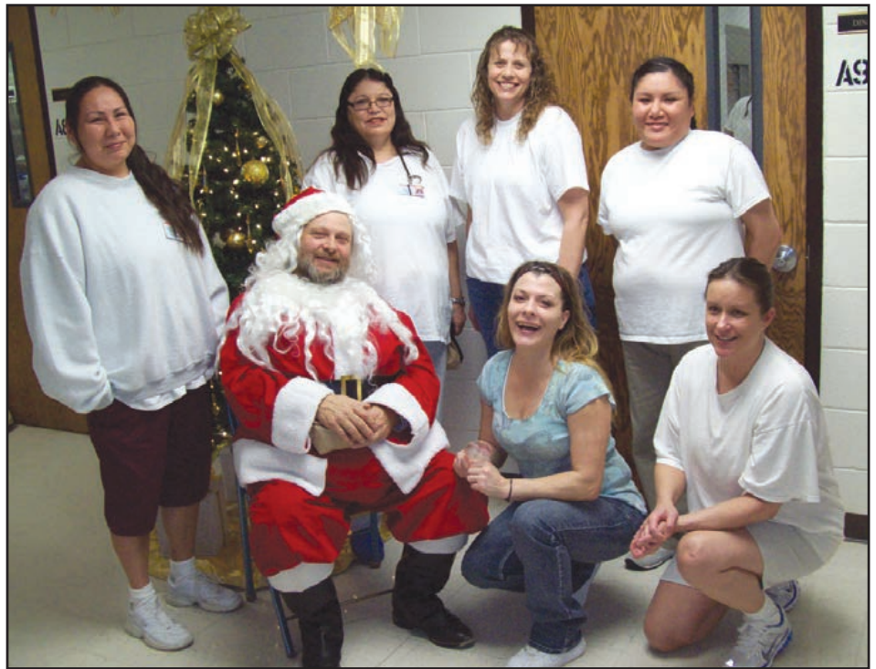
Santa with a small group of inmates at DWCR in New England.

The New England Lions have visited the prison with Santa each year since the facility opened in 2003. Lions who have