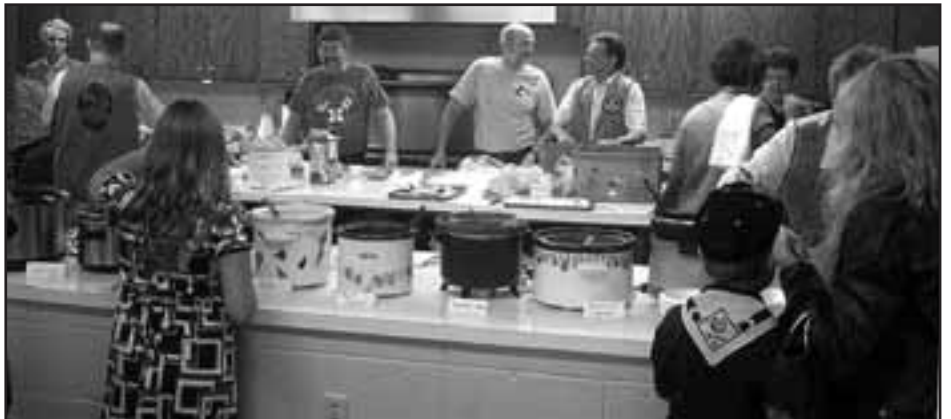
The Bowman Lions Club held its annual Super Bowl Soup and Sandwich Benefit on Sunday, Feb. 1 at the Bowman Lutheran Church. The benefit was well attended. The local Cub Scouts and some of the Dakota Prairie Helping Hands HOSPICE members also volunteered to help with the event. The benefit was held to help purchase medical equipment for a local resident.