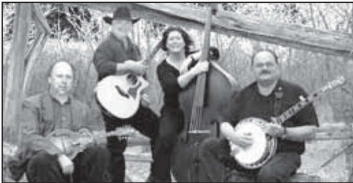
Cottonwood – a North Dakota bluegrass group - provided a wonderful afternoon of music.