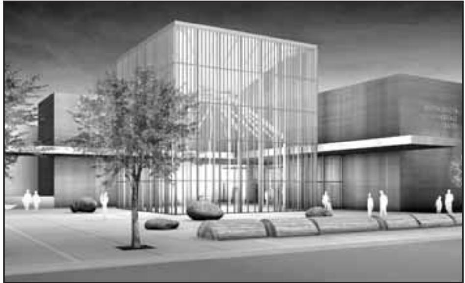
This night view from the east shows the architect's drawing of the proposed expansion to the North Dakota Heritage Center.