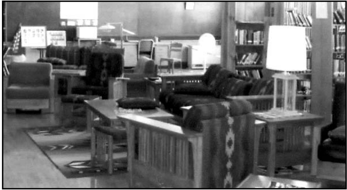
Lounge (formerly library)