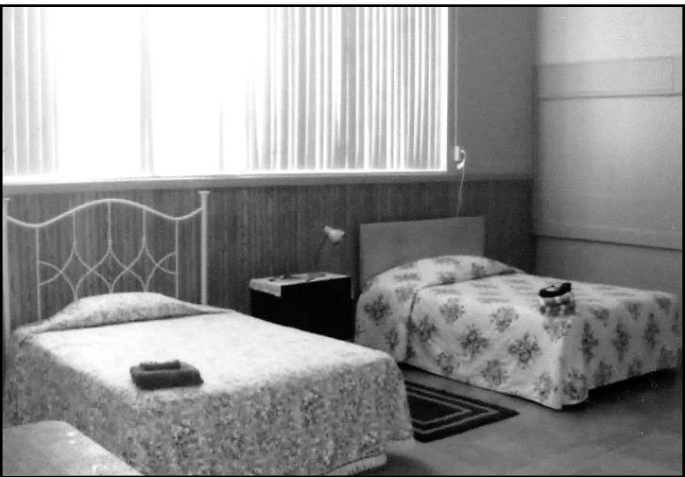
One of the bedrooms (former classroom).