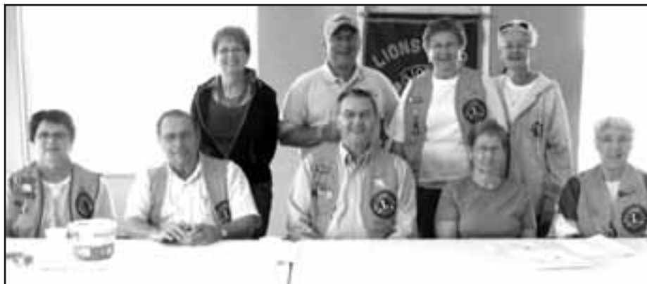
Pictured above are members of the Carrington Lions as they are preparing to register entries into their golf tournament June 12.

Proceeds from the golf tournament will be used to support the