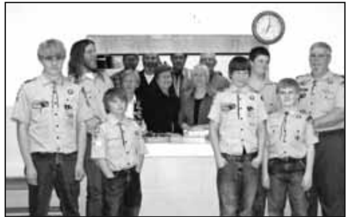
Reeder Lions and the Hettinger Boy Scouts.