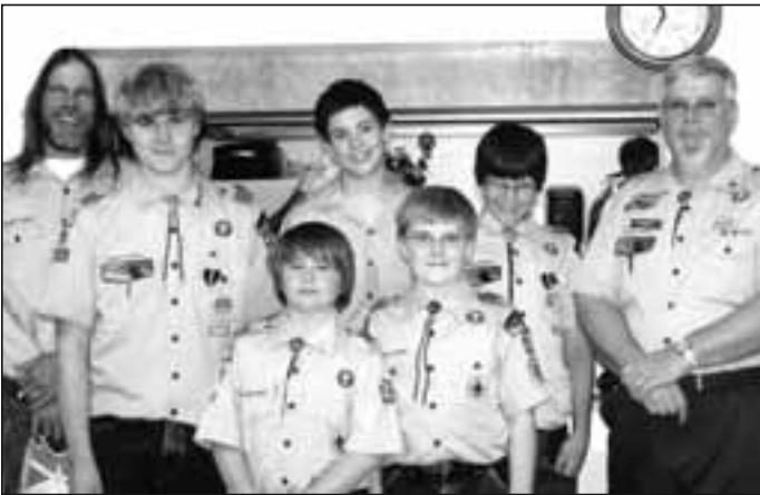
Boy Scouts from Hettinger volunteered to help serve.