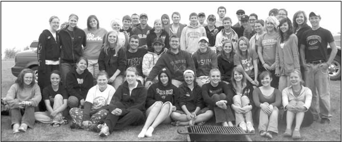
A number of participants from this year's North Dakota Leadership Seminar used updating a trail at the Garrison Dam National Fish Hatchery as their volunteer service project.