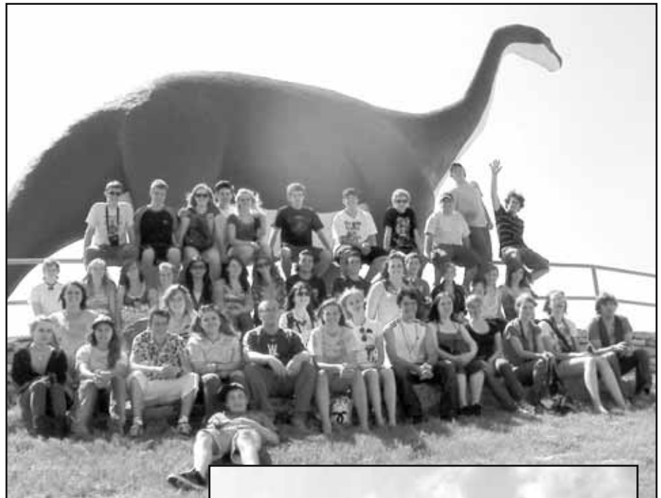
Forty-two happy Paha Sapa campers at Dinosaur Park in Rapid City.

5-SW Lions Clubs were very generous in providing many plentiful and exceptional meals for the youth attending the camp. A special thank you to the Lions of Belle Fourche, Lead-Deadwood, Spearfish, Sturgis, RC Downtown, RC Rushmore, RC Evening Star, RC Metro, Hill City, Custer, Edgemont, and Hot Springs for providing meals along the road for our campers.