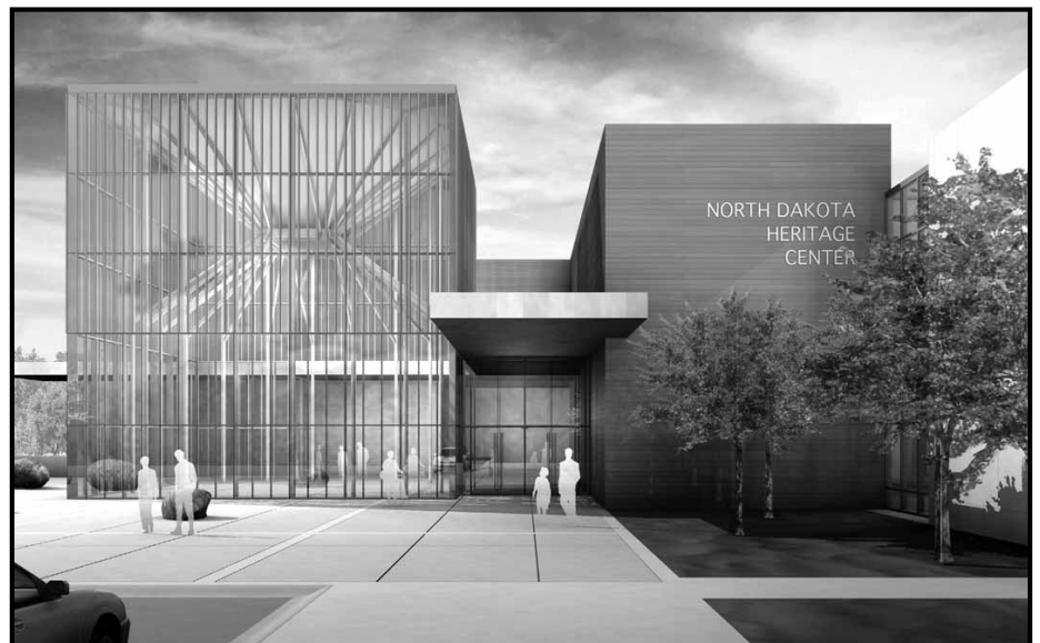
This is the new front entrance to the expanded North Dakota Heritage Center shown from the north on the State Capitol Grounds in this artist's rendering.