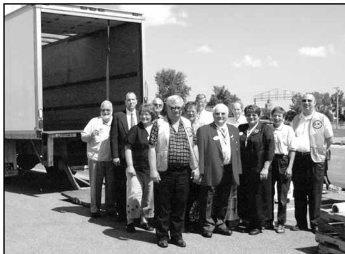
Lions members loaded equipment on Cross-Country Courier truck for shipment to Bismarck.

The Minot Lions Club wishes to thank the Bismarck Lions Club for spearheading these two very important and time-consuming parts of the ND Eyeglass Recycling Program. The club also continues to encourage Lions Clubs as well as other sight minded organizations to continue collecting used eyeglasses and sending them to the Minot Lions Club for the initial sort. Currently, the ND Eyeglass Recycling program has processed in excess of 650,000 pair of glasses over the last eleven years and with the help of the Bismarck Lions Club.