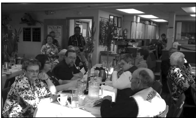
A full house of supporting Lions Clubs attended the South Heart Lions Charter Celebration. Lions from Dickinson, Bowman, New England, Williston, Mandan and New Salem enjoyed a fun filled evening. Much tail twisting left pockets empty!