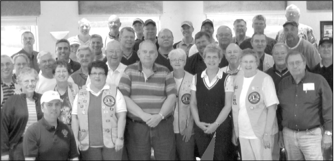
Pictured are all of the Lions Club members who were in attendance at the Carrington Lions Club Golf Tournament at Carrington Friday, June 11.