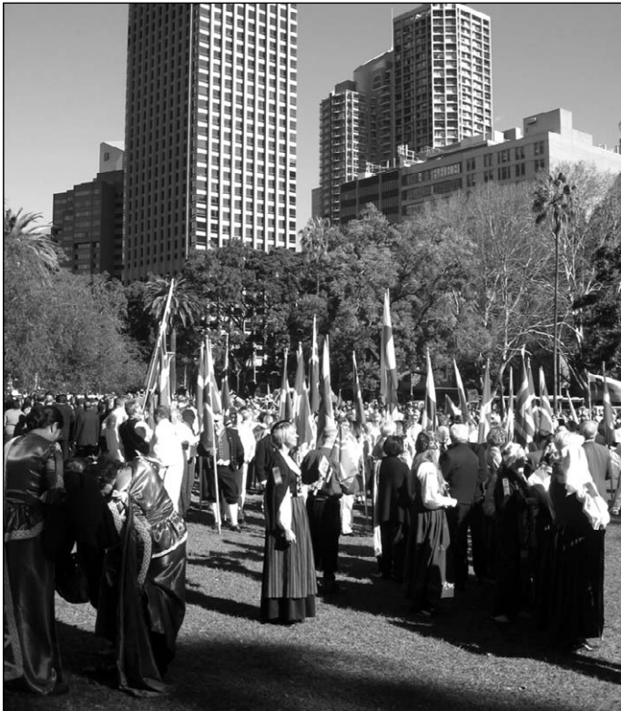
Lions of the world at the staging area before the parade.