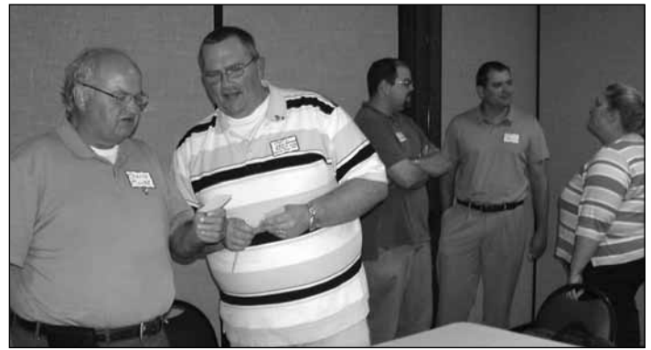
Lions from Larimore Turtle River, Red River, and Mayville-Portland discuss club projects at the Region 4 Rally in Grand Forks.