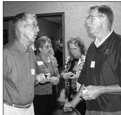
Region 4 Rally participants from Northwood, Emerado-Arvilla, Red River, and South Forks compare notes about ways to increase service in their communities.