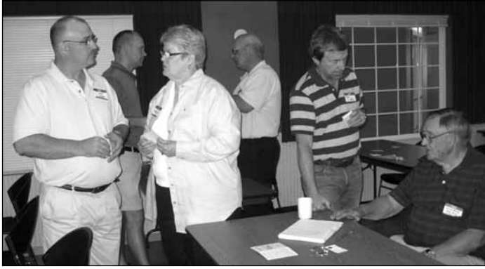
Casselton, Fargo, Horace, Fargo Gateway, and West Fargo Lions mix it up as they consider how being a Lion motivates them to do more service.