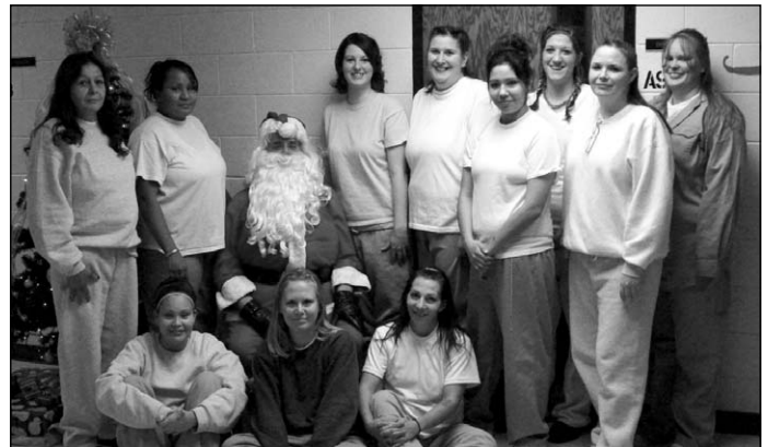
New England Lion's Santa poses with a small group of the inmates at North Dakota's women's prison, after giving sacks of goodies to more than 100 inmates there.

program, Santa distributed sacks of goodies to children who also were