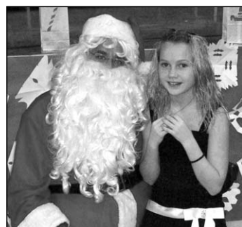
Santa with one of the girls who got in line to sit on Santa's lap and get a sack of candy, nuts and fruit, following the NEPS Elementary School Christmas program.

happy to receive the candy, nuts and fruit, along with a hearty "Merry Christmas!" from a very exuberant Santa.