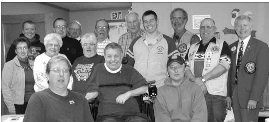
Gackle Lions visit.