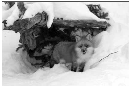
MD5 environmental photo contest winner.

The red fox emerging from its den photo was taken at the Fargo Lions Conservancy Park in south Fargo. After the 1997 flood, houses along the section of the Red River near Rose Creek were removed to eliminate the need for flood protection. At that