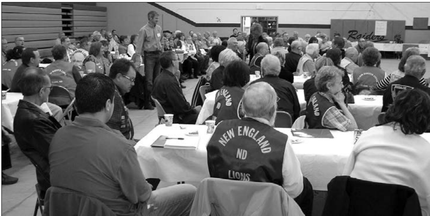
A strong showing by Lions members in District 5NW made the Spring Rally a great success.