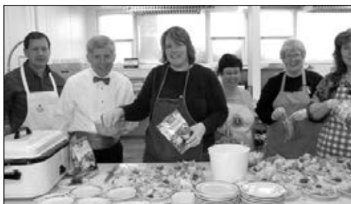
The Fargo Lions Club partnered with Elim Lutheran Church to serve a spaghetti dinner supporting World Hunger Relief.

Join us on Thursday, June 2, 2011 as we celebrate the 90th Anniversary of Fargo Lions Club. Between 5 and 9 p.m. Our