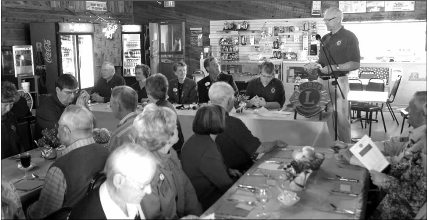
Around 40 current Lions, former Lions and guests were in attendance at the Hazen Lions Club's 35th anniversary celebration at the Hazen Golf Course.