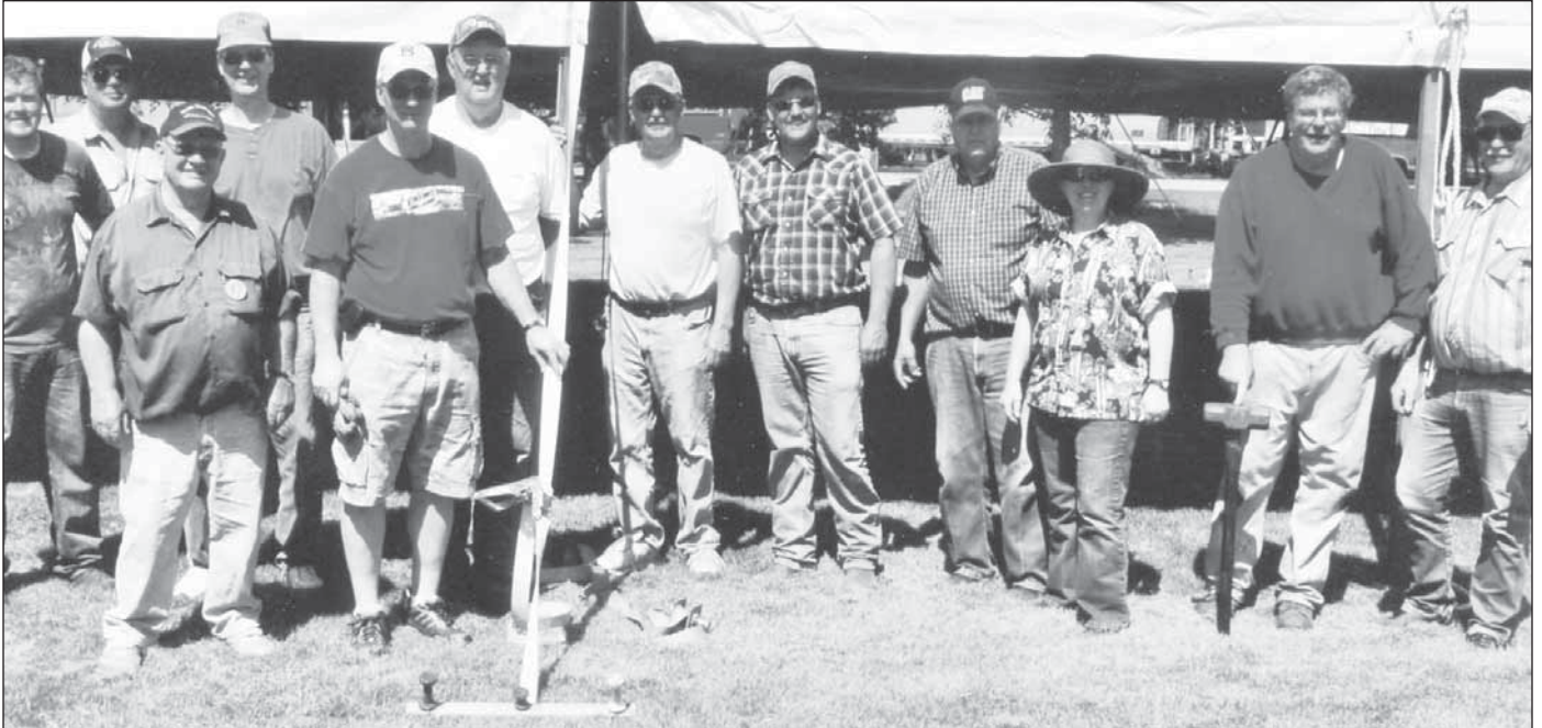
The Enderlin Lions Club have been involved in many community projects. The above picture was taken following the setting up of their tent for the All School Reunion. Prior to the event, they secured a new roof on the Baxter Park picnic shelter.