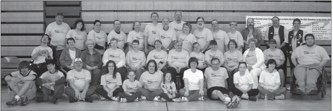
A large number of people participated in the 2nd annual Strides Walk, sponsored by the Mandan Dakota Lions.