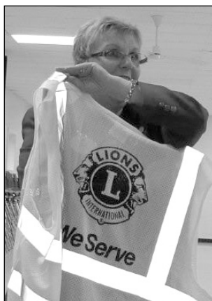
Lion DG Pat shows off the high visibility Lions vests that were purchased and used Aug. 10 to distribute the cleaning kits to some of those affected by the flooding in Minot. Vests were purchased from District Funds to be used by Lions Disaster Teams.