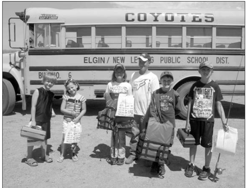
Pictured are participants and volunteers who took part in the 16th annual kids fishing day at Sheep Creek Dam south of Elgin.

The prizes were donated by the North Dakota Game and Fish Department. The Elgin Lions Club made available $5 Elgin Bucks gift certificates for each person.