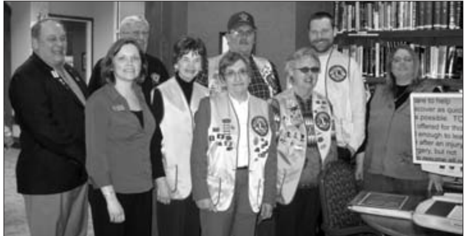
Red River Lions – Grand Forks sponsor a video magnifier for 4000 Valley Square Memorial Homes in Grand Forks.