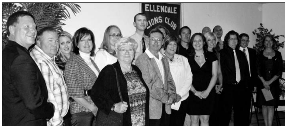
Pictured are new Ellendale Lions Club members at their Sept. 17th Charter Night.

A donor can make the $1,000 gift and, if desired, wait until a later date to actually designate the fellowship recipient. A number of SNE clubs had done this as of June 30, 2011. The following clubs had made donations and were eligible to make Melvin Jones Fellowship designations: Argusville-Gardner-Grandin Valley 1, Braddock 1, Carrington 1, Emerado-Arvilla 1, Fargo 1, Fargo Gateway 1, Grand Forks Red River 1, Grand Forks South Forks 3, Horace 4, Jamestown 5, Kindred 4, Linton 1, Oakes 1, Rugby 7, and Wishek 1. that our clubs have scores of deserving