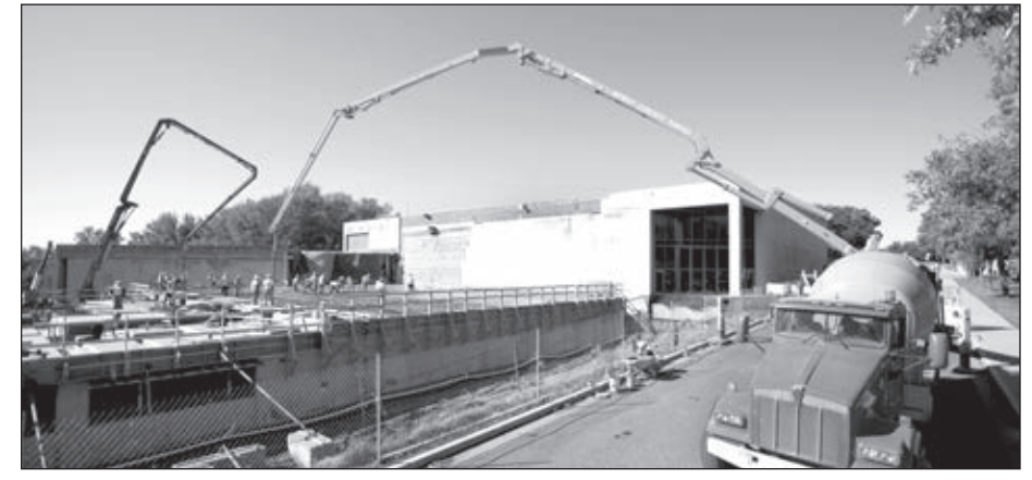
Construction crews work on the North Dakota Heritage Center expansion in late September.

In addition to pledges by state clubs, the Lions are helping identify candidates for the History's Heroes giving program. This program recognizes individuals, families or communities who make a $10,000 donation and preserves their histories at the North Dakota Heritage Center.