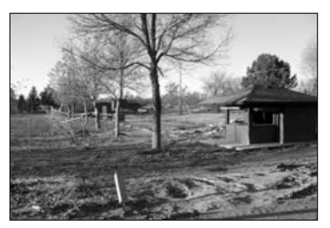
Burlington Sports Complex after the 2011