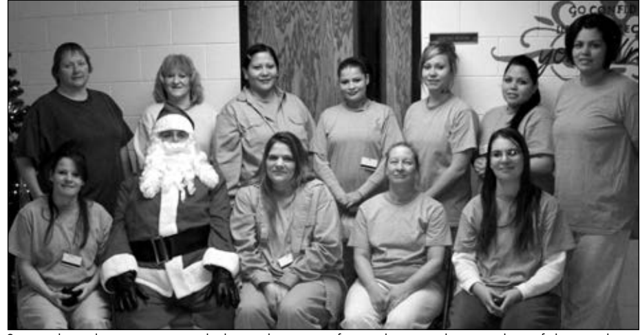
Santa shared some time, including taking time for a photo, with a number of the residents at the Dakota Women's Correctional Rehab Center in New England. The visit by Santa and the New England Lions has become an annual tradition and is looked forward to by those at the center.

Although policy discourages it, some of those inmates just can't resist the urge to hug the Lions who have made them feel so