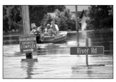
Burlington Sports Complex during the 2011