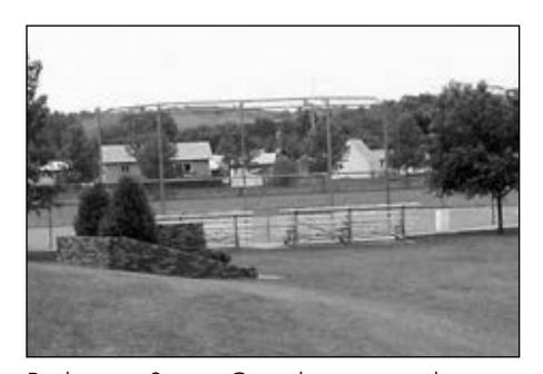
Burlington Sports Complex prior to the 2011 flood.