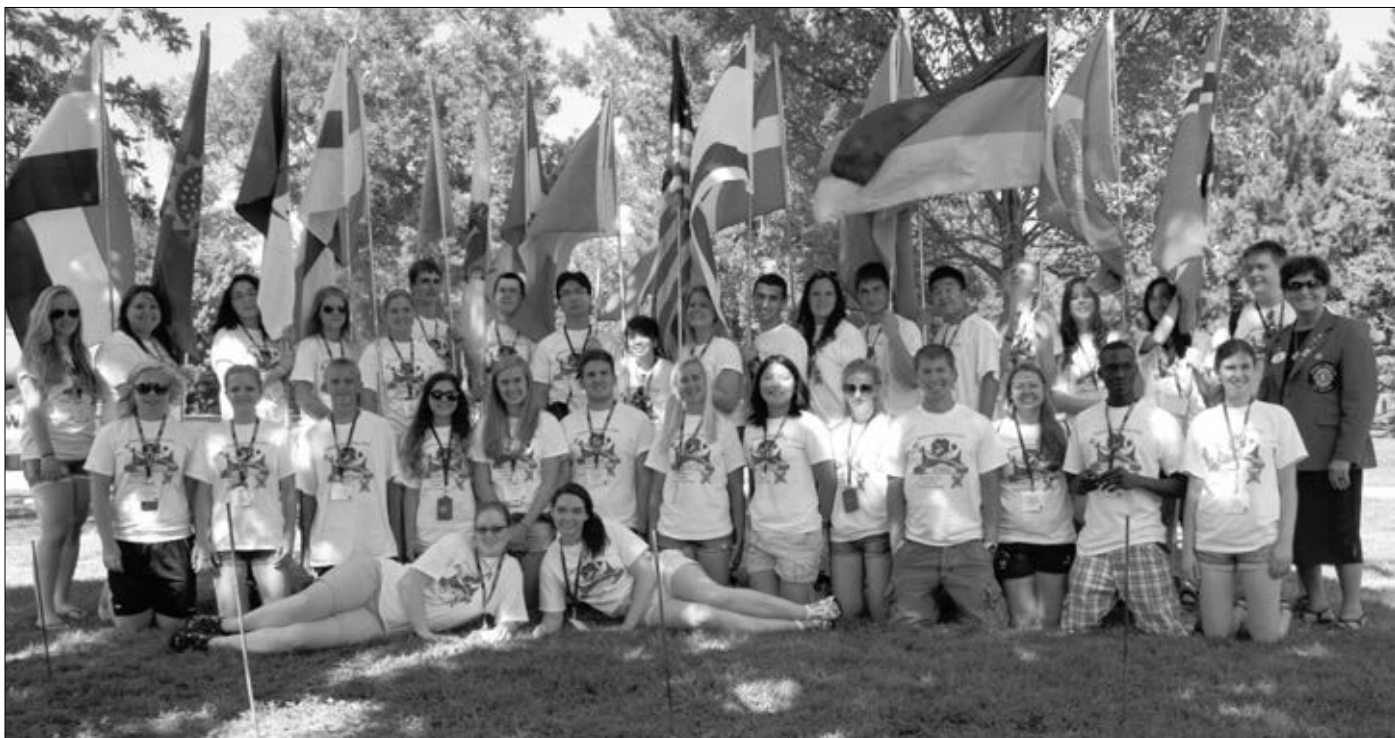
Youth Camp attendees and volunteers gathered for a photo.