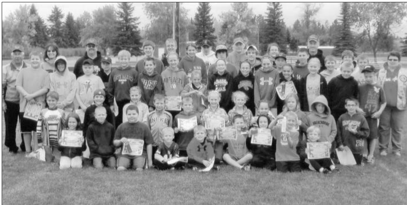
Pictured are all of the student athletes and Carrington Lions Club members who took part in the club's sponsored PPK contest.