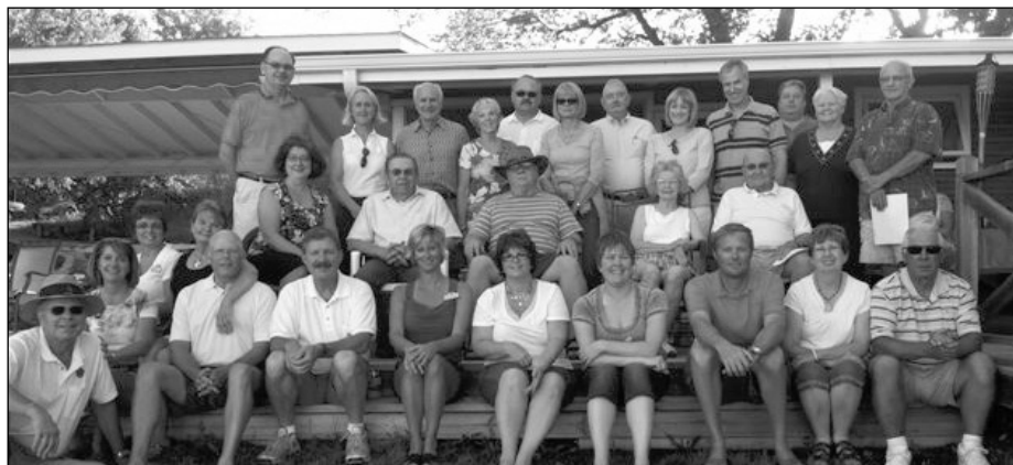
Jamestown Lion Club members and family gather for a photo.