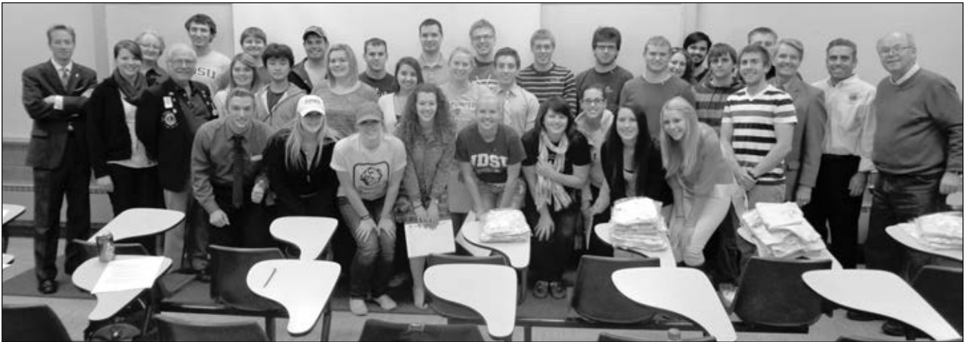
Current campus club members and their guests from the Fargo Lions Club pose for a group photo following the induction.