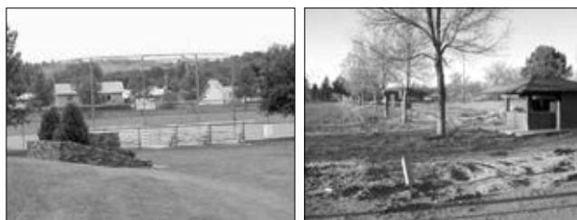
Burlington Sports Complex before, during and after 2011 flood.

Used by more than 700 youth each week in the summer to play baseball and countless children and families enjoying the playground and park facilities. The complex was devastated by the 2011 flood.