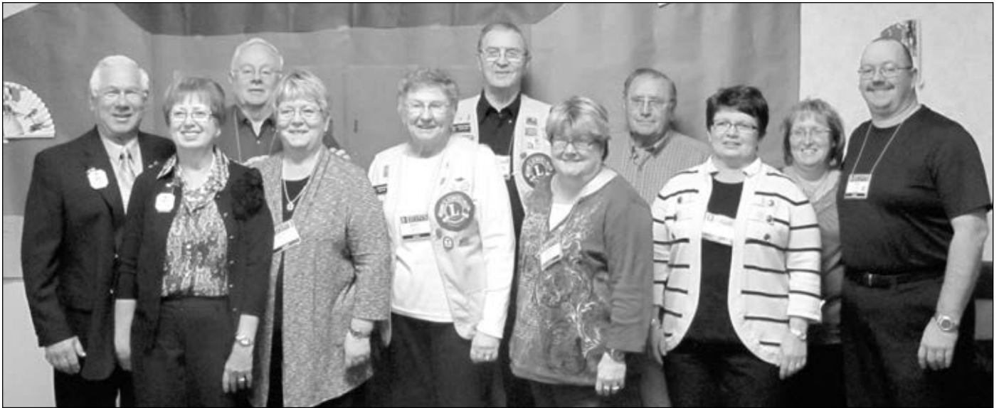
Carrington Lions came out in force to attend the 2012 Lions Convention.