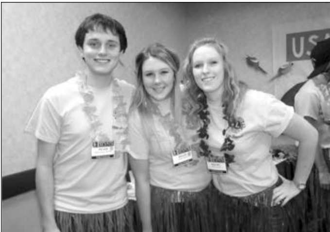
In Hawaii, campus Lions created a warm environment where hoola hoopers demonstrated a few moves that would send the average Lion to a chiropractor!