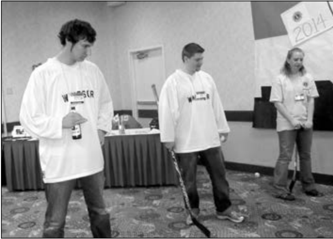
Lion visitors traveled to Canada where the campus Lions staged a hockey shootout.