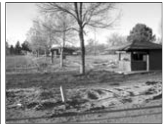
Burlington Sports Complex before, during and after 2011 flood.

Used by more than 700 youth each week in the summer to play baseball and countless children and families enjoying the playground and park facilities. The complex was devastated by the 2011 flood.