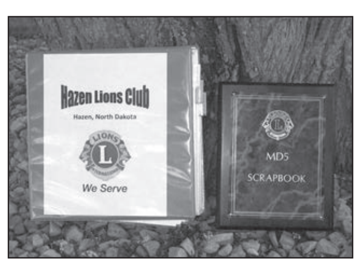
The Hazen Lions Club Scrapbook and the award it won at Yorkton.