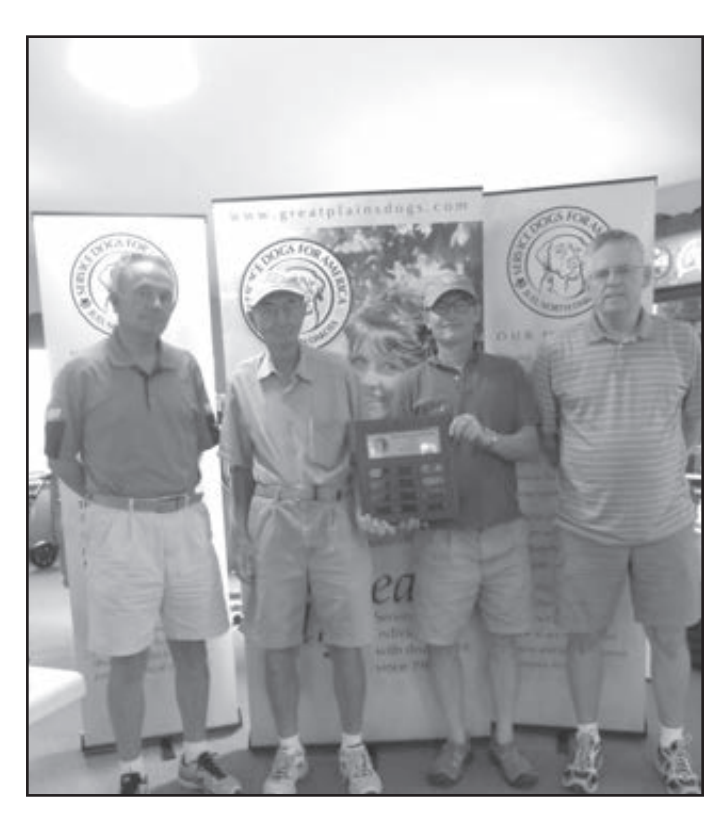
Members of last year's winning team were from Oakes.