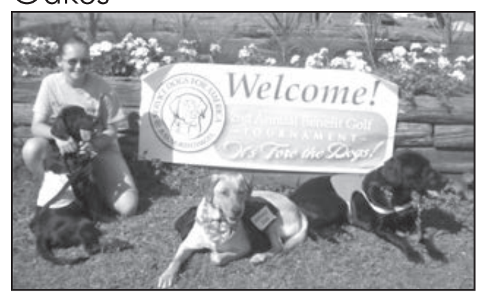
Service Dogs welcome golfers