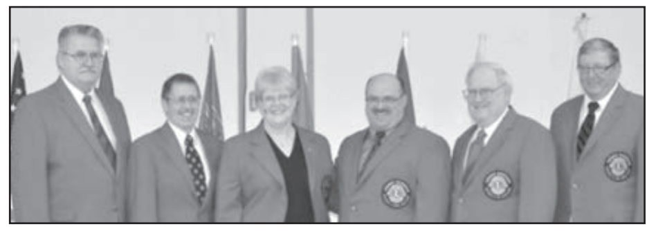
District Governors of MD 5 for 2013-14

There are clubs with Facebook pages, too. Please share those addresses.