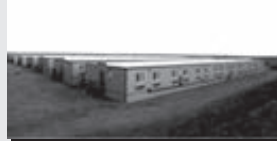
Target Logistics Man Camp Tour Near Manning, ND