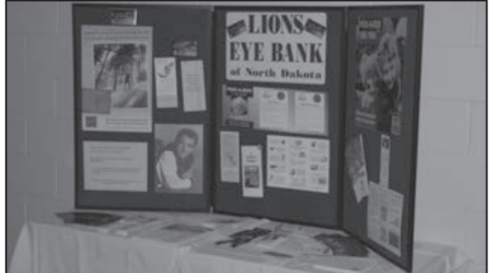
Lions Eye Bank of N.D. display which was presented at the fundraiser