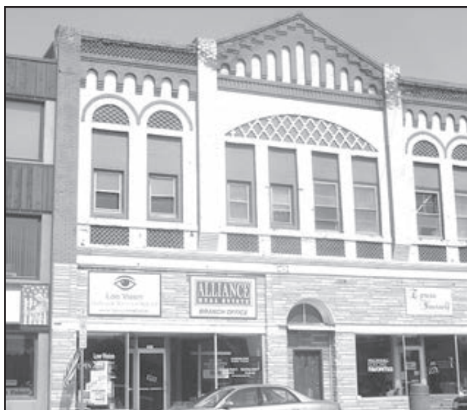
The North Dakota Lions eyeglass recycling center moved to 320 West Main Street in downtown Mandan in June.