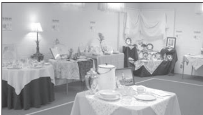
A variety of tables were presented which makes "Tables Envisioned" interesting.

Several folks have expressed an interest in having a table for next year. With that in mind, the Rugby Lions Club will continue to "dish" up the fundraiser for the community and beyond.