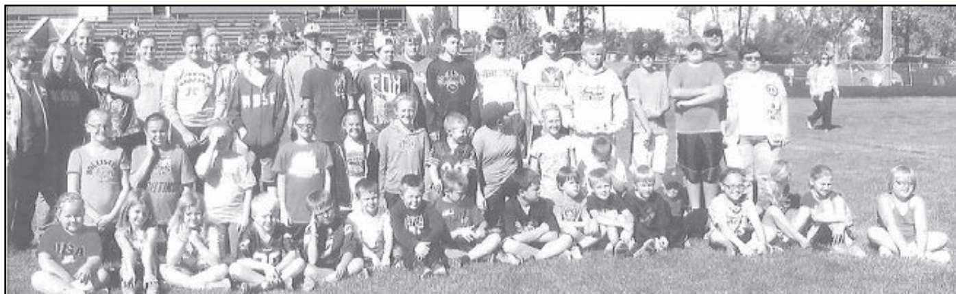
Pictured are the young student-athletes from the Carrington area who took part in the local PP&K contest. This competition was Sunday, Sept. 15. Forty youth participated.