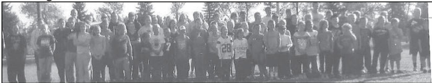
Pictured are the student-athletes from around the state who took part in the sectional contest for PP&K. The sectional competition was Oct. 6 with 72 youngsters participating.