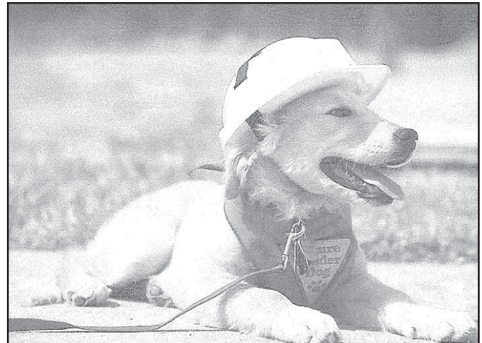
A future Leader Dog is happily supervising the early construction phase of the Leader Dogs for the Blind kennel building project.

The one-year Kennel Redesign Project initiative will end next June 30. Because of